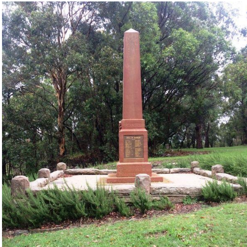
Meadowbank War Memorial