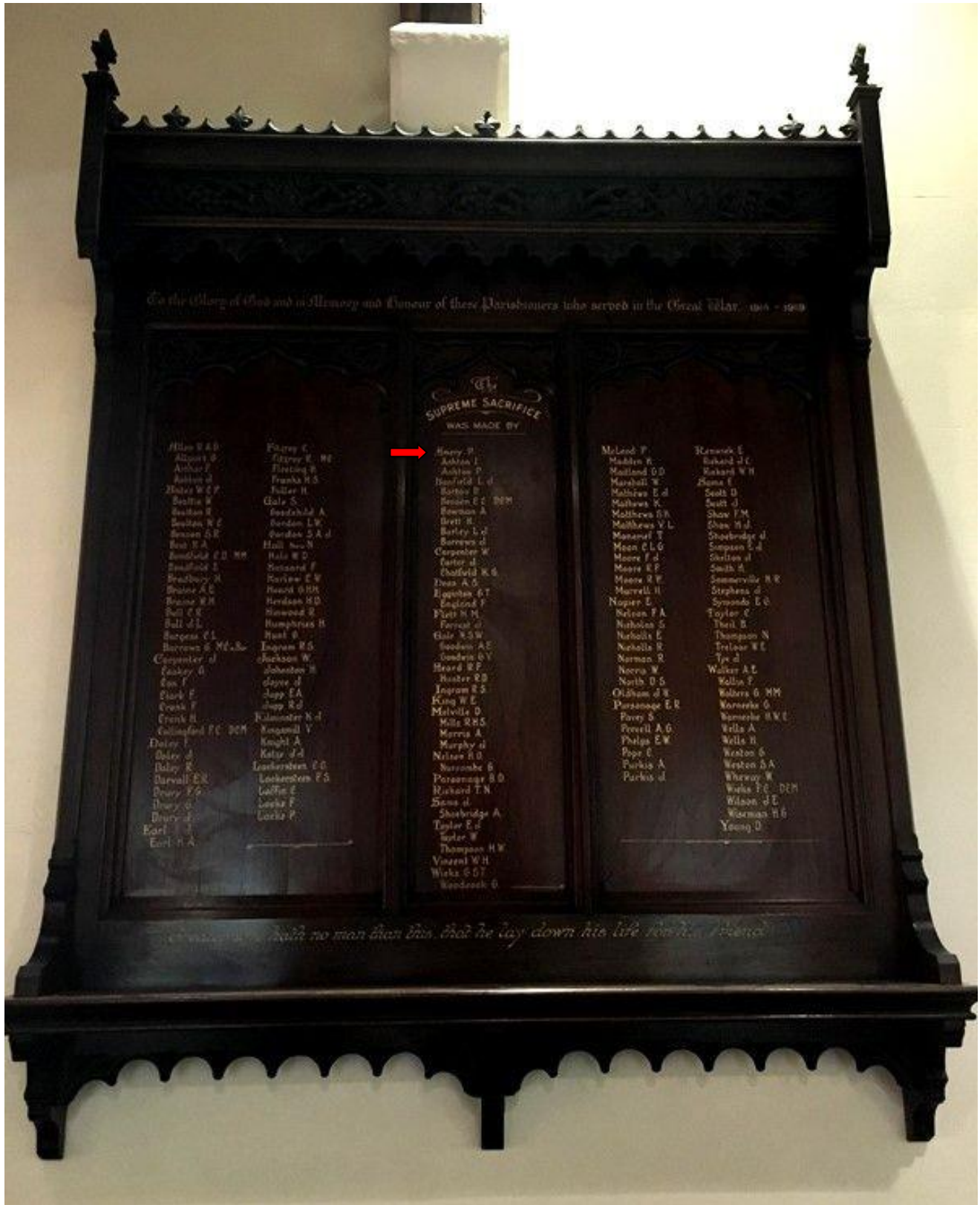
St. Anne's Honour Roll, Ryde