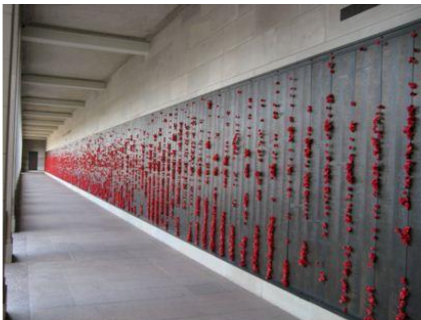
Roll Of Honour WW1 Australian War Memorial Canberra, Australia

Private P. Amery is commemorated on the Roll of Honour, located in the Hall of Memory Commemorative Area at the Australian War Memorial, Canberra, Australia on Panel 82.